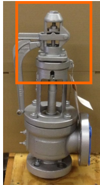
ASME Section I style valve with Open Lever