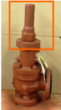
ASME Section VIII style valve with Screwed Cap

Safety relief valves are often classified as having a Screwed Cap, Open Lever or Packed Lever. ASME Boiler and Pressure Vessel Code establishes these requirements. Illustrations below describe Caps and Levers.