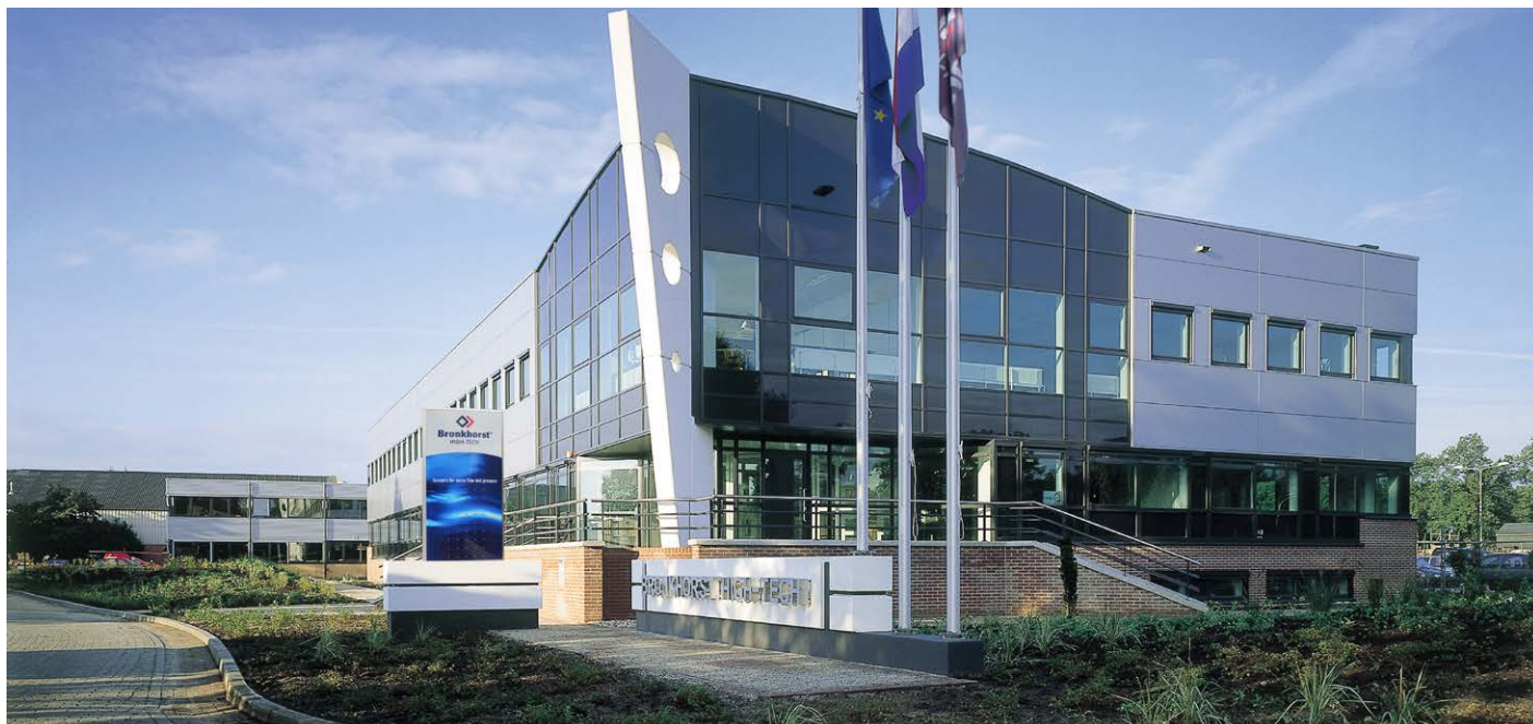
BRONKHORST HEADQUARTERS, THE NETHERLANDS